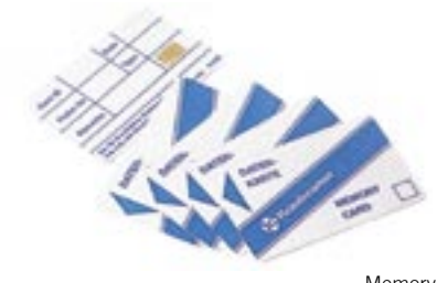
for the storage of measurement and calibration data as well as report formats