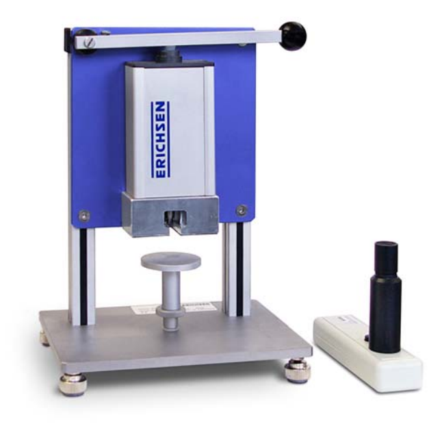
PAINTXPLORER 548 with drilling stand and measuring microscope