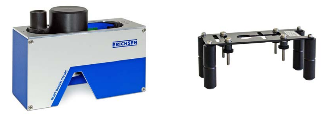
PAINT BORER 518 MC with specimen platform