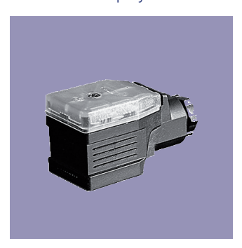
Signal conditioner MUW... (integrated in plug connector) with supply voltage 24 V and voltage or curent output signals.

Pivot head Z-60 with internal thread M6x12, P/N 058100. Process-controlled indicators MAP... with display.