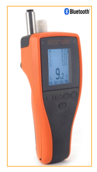
Elcometer 319 Dewpoint Meter with Bluetooth®<sup>†</sup>