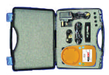
850EMTK 850EMT Service Tool Kit

850EMT Service Tool Kit Stylus Ancillary Lead Carry Case & Accessories Anc. Lead Spare Pins (Pk 10)