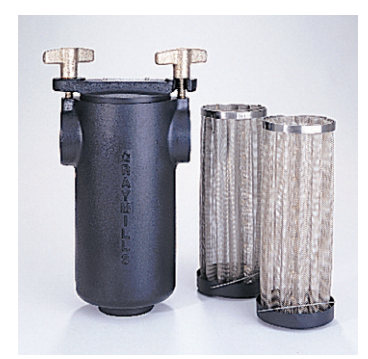
Superflo® Filters with stainless screens (various mesh/micron screens available).