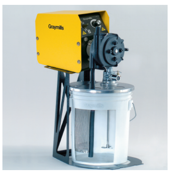
1 or 2; 3 or 5 gallon stands; pump bolts to top of stand (Shown with pump, bucket and mixer.)