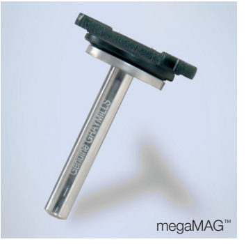
Powerful stainless rare earth magnet fits filters and removes metal particles; bracket mount version fits in pails.