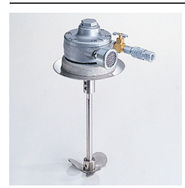
Mixer keeps material blended and at uniform viscosity.